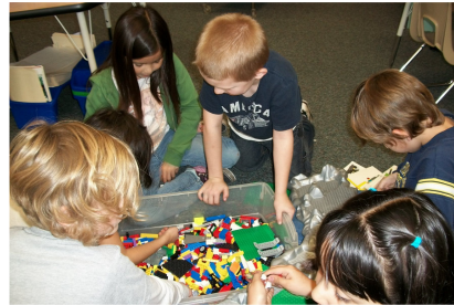
Students working with Legos to create stories!