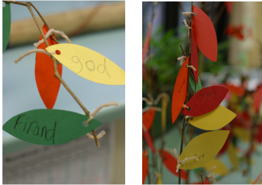
Thankful trees, what students are thankful for!

Here is just a sampling of some of the work that students have been doing over the past month. Enjoy the work!