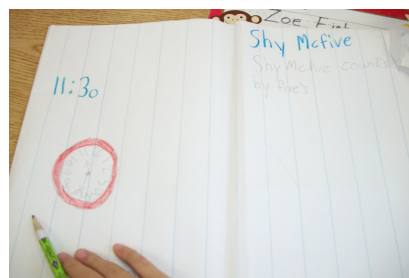
Students working together to make books on telling time!